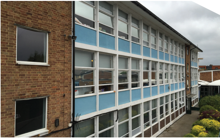
BEFORE Featherstone High School / Middlesex, UK