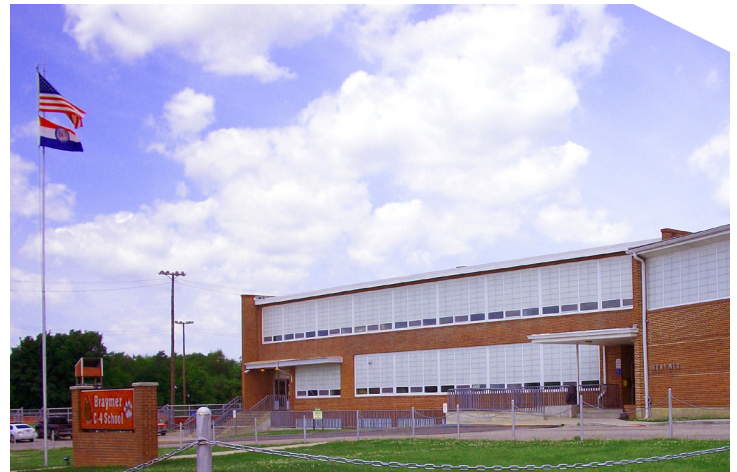
Braymer C-4 School Braymer, MO