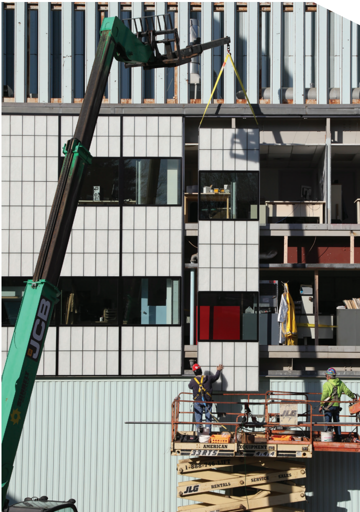
Newington Power Station Newington, NH