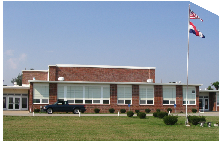
Harden Central C-2 School District Harden, MO