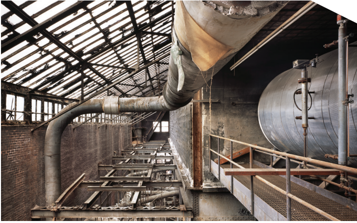
BEFORE Charles H. Shaw Technology and Learning Center / Chicago, IL