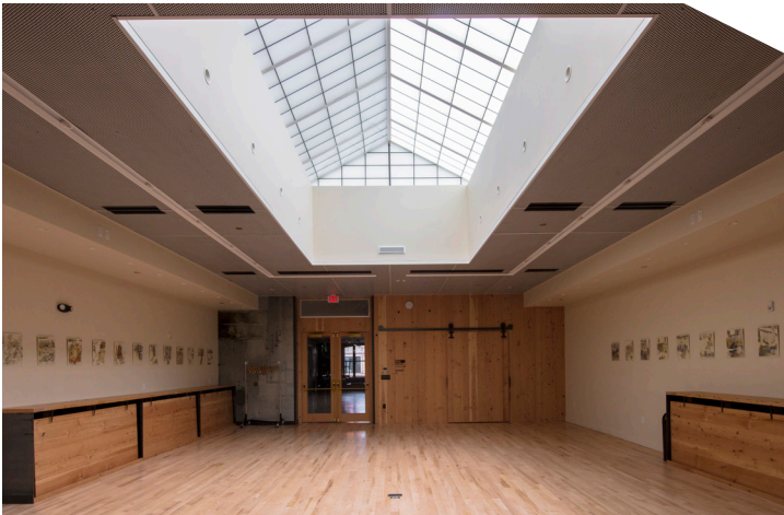
Rialto Theatre Bozeman, MT