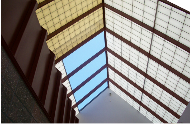
Olathe North High School Olathe, KA

Regular maintenance and cleaning are essential to keep your project in top condition. We offer weatherproof coatings and annual maintenance/servicing programs. Contact your SGH Concepts representative to learn more.