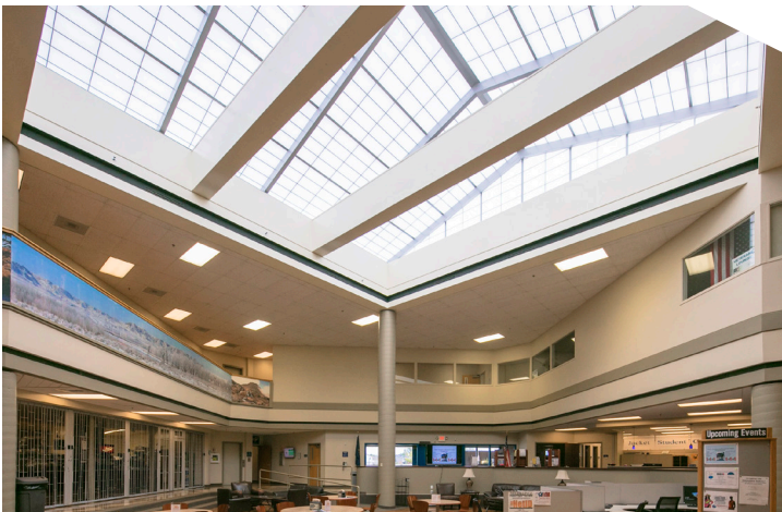
City College, Montana State University Billings, MT