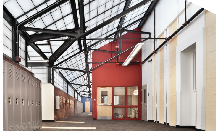
AFTER