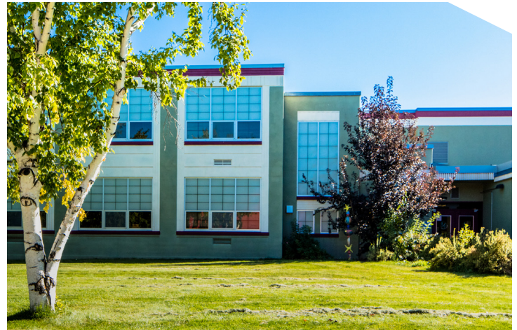
Hawthorn Elementary School Bozeman, MT