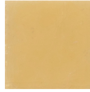
Standard Commercial Face Sheet