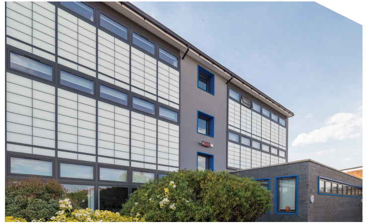
AFTER ©Alex Upton

SGH Concepts is centrally located in seven cities serving ten states.