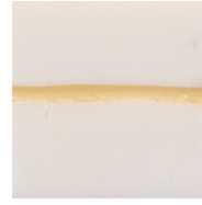
Standard Face Sheet w/ Film/Coated