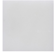
Kalwall Standard Super-Weather

In the photo (left) of Olathe North High School, you can see the original Kalwall installed years ago, made evident by the yellowing face sheets. Kalwall’s original panel technology consisted of little to no UV erosion resistance. Today’s installed panels feature Kalwall’s newly incorporated super-weathering fiberglass sheets produced with an exclusive resin formula only available with Kalwall—that’s right, the competition still uses the original yellowing face sheets.