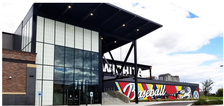
Wichita Baseball Stadium / Wichita, KS Kalwall