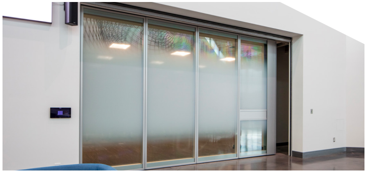
WSU NetApp / Wichita, KS Dri-Design & Modernfold