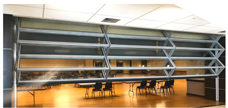
Emporia State University / Emporia, KS Skyfold