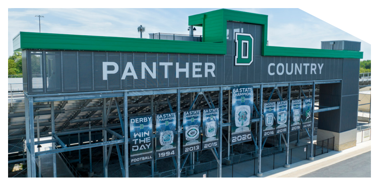
Derby Panther Stadium / Derby, KS Centria