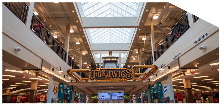
Scheels East Towne Square / Wichita, KS A-Plank & Kalwall