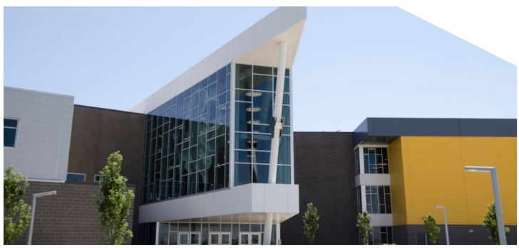
Garden City Community College / Garden City, KS Centria