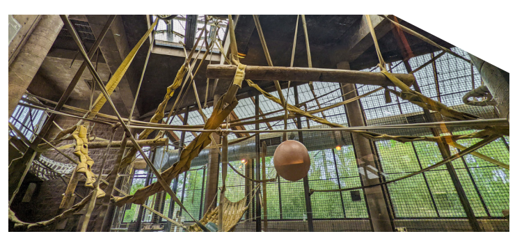
Sedgewick County Zoo / Wichita, KS Kalwall