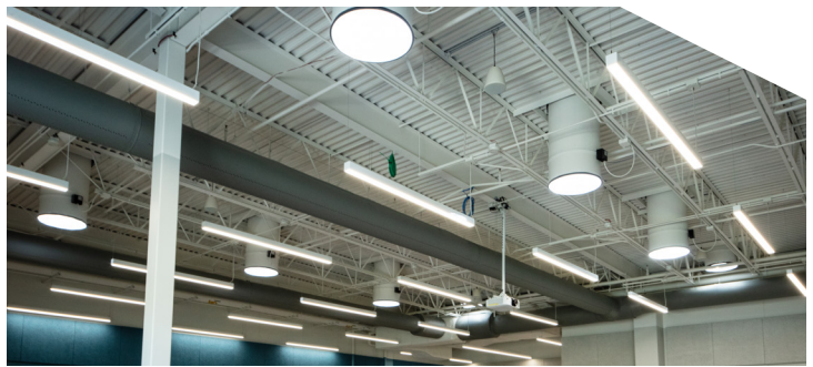
Piper Elementary School / Kansas City, KS Solatube