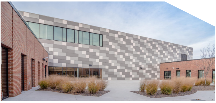
Maize Middle School / Hutchinson, KS Dri-Design