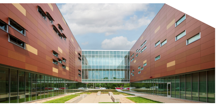
Manhattan High School / Manhattan, KS Swisspearl