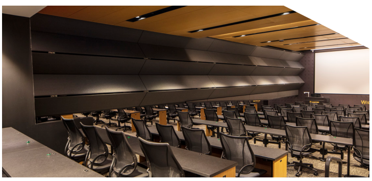
WSU Woolsey Hall / Wichita, KS Skyfold