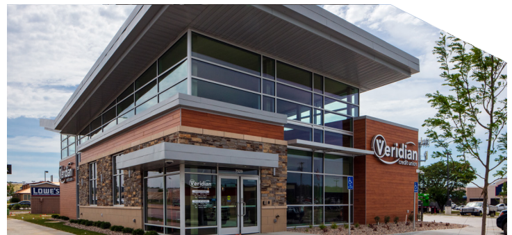
Veridian Credit Union / Omaha, NE A-Plank