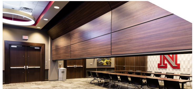
University of Nebraska-Lincoln Student Union / Lincoln, NE Skyfold