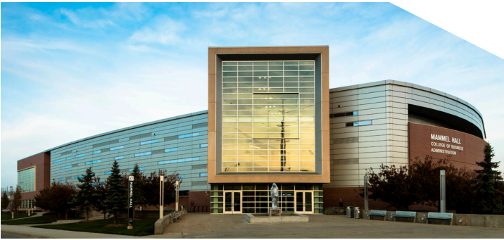
University of Nebraska-Omaha Mammel Hall / Omaha, NE Centria