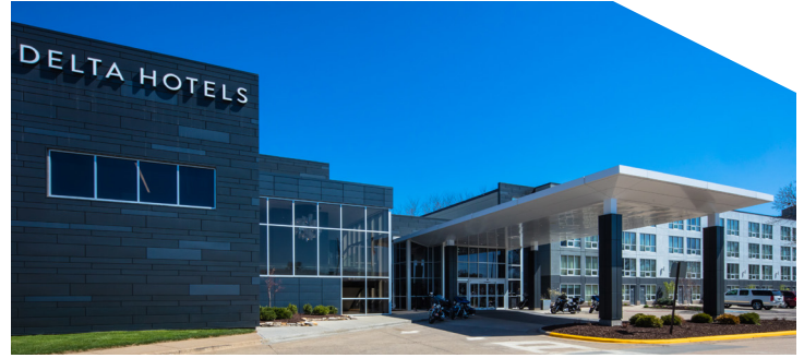
Delta Hotels by Marriott South Sioux City Riverfront / Sioux City, NE Dri-Design / Genwall / Sieccoline