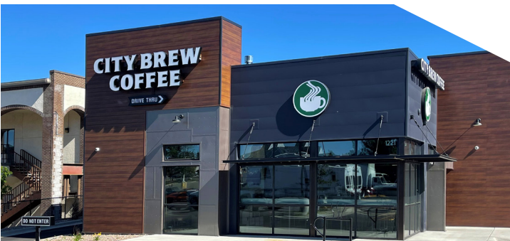
City Brew Coffee / Great Falls, MT A-Plank