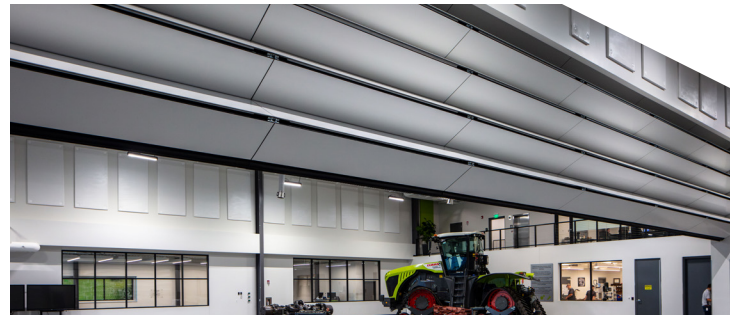
CLAAS of America Training Academy / Omaha, NE Skyfold

SGH Concepts is centrally located in seven cities serving ten states.