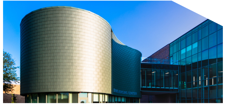
Krone Advising Center Morningside College / Sioux City, IA Zinc Flatlock