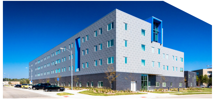
St. John Paul II Newman Center / Omaha, NE Dri-Design / Fundermax