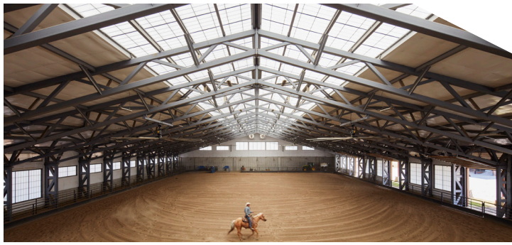
Palisades Ranch / Red Lodge, MT Kalwall