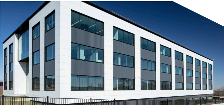
SCC Health & Sciences Building | Lincoln, NE Swisspearl / Genwall