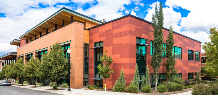
Montana State Fund Bank / Helena, MT Swisspearl / Kalwall / Misc.