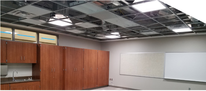
Waukee Elementary School #8 / Waukee, IA Solatube