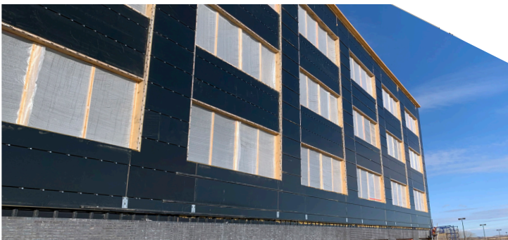
SCC Health & Sciences Building / Lincoln, NE Genwall Insulated Backup Wall System