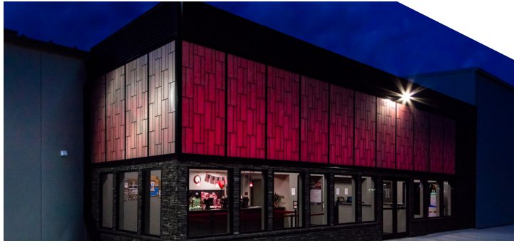
Drop Zone Family Fun Center / Sioux City, IA Kalwall