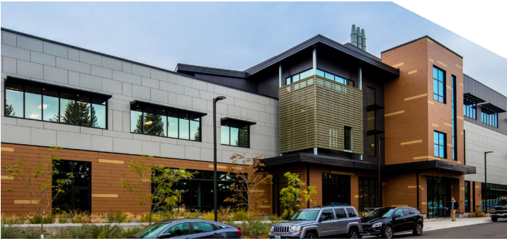
Montana Tech NRRC / Helena, MT Swisspearl / Centria