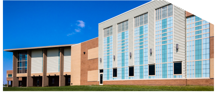
Elkhorn South High School / Elkhorn, NE Centria / Kalwall