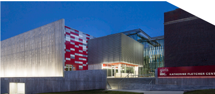
Girls, Inc. / Omaha, NE Genwall / Sieccoline / Misc. / Zinc