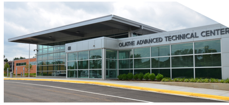
Olathe Advanced Technical Center / Olathe, KS Centria / Dri-Design