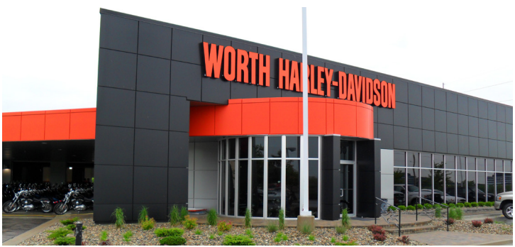
Harley-Davidson / Kansas City, MO Sieccoline