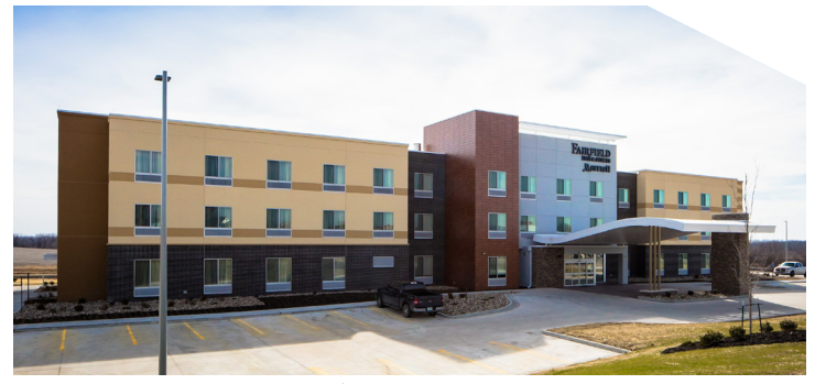
Fairfield Inn & Suites Marriott / Chillicothe, MO FunderMax