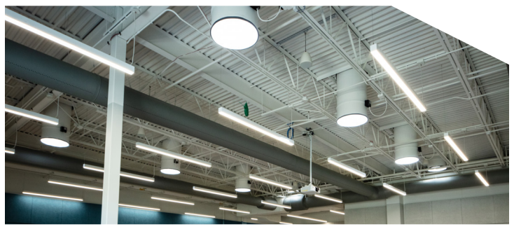
Piper Elementary School / Kansas City, KS Solatube