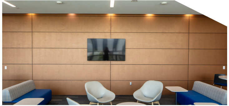
Des Moines Municipal Service / Des Moines, IA Swisspearl