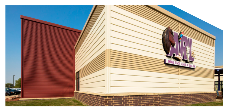
Animal Rescue League of Iowa / Ankeny, IA Centria