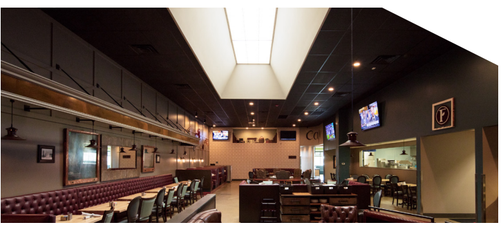
The Fletcher Bar & Grill / Ankeny, IA Centria / Kalwall