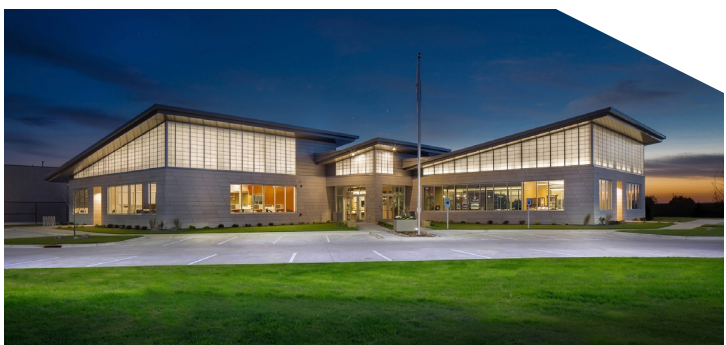
Miron Construction Offices / Cedar Rapids, IA Kalwall