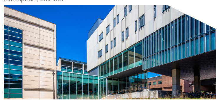
Seamans Center University of Iowa / Iowa City, IA Flat Lock / Misc.