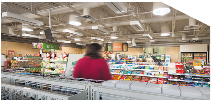
Kum & Go / Nationwide (100+ Locations) Tubular Daylighting Devices