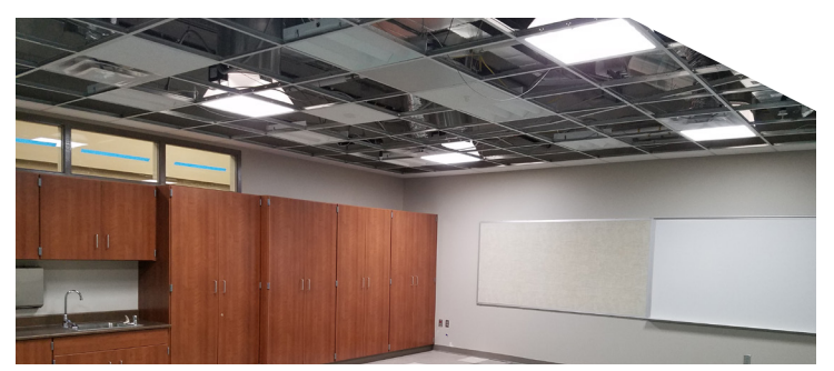
Waukee Elementary School #8 / Waukee, IA Tubular Daylighting Devices